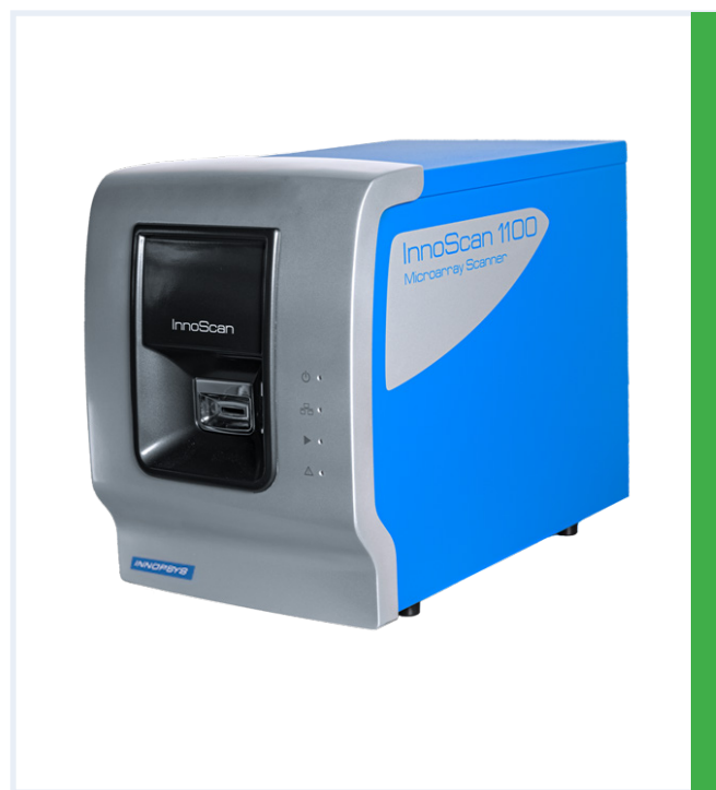
Image acquisition & analysis software

Barcode reader Accurate control of acquired images Scanner supplied with a validation slide which verifies scanner performance