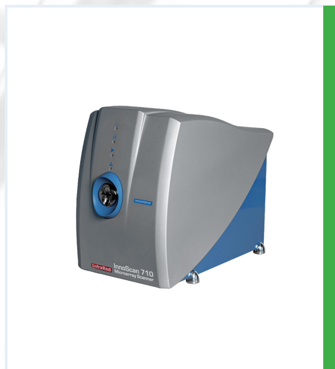
Image acquisition & analysis software

From 10 to 35 lines per second Test results obtained very quickly 3.6 minutes to read and entire slide with 10µm/pixel